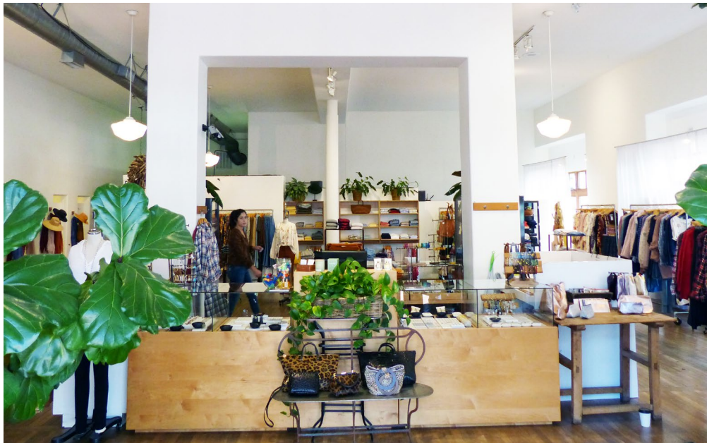
04 – Former interior layout of 833 State Street