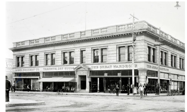
02 – Historical photo of the Howard Canfield Building.