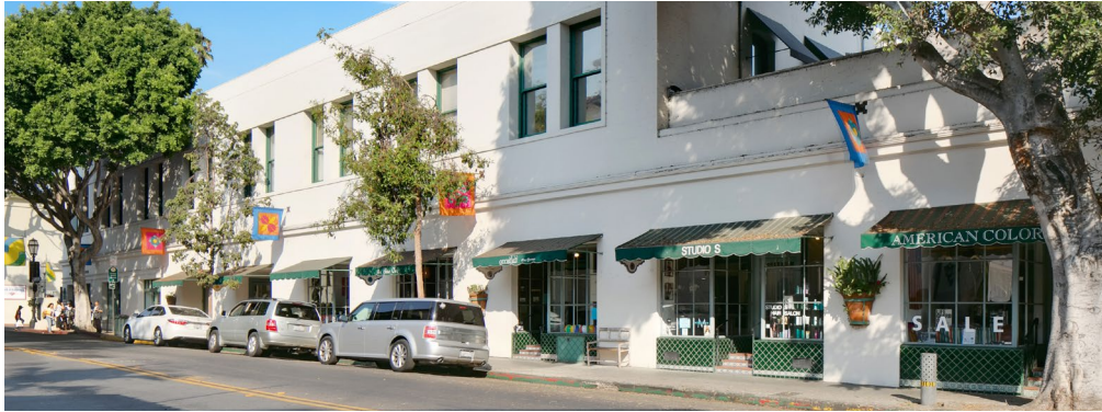
03 – View of the Howard Canfield Building from Canon Perdido Street.