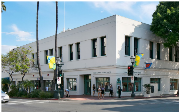
01 – The Howard Canfield Building today.